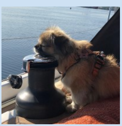
Little Sophie - SV Relentless