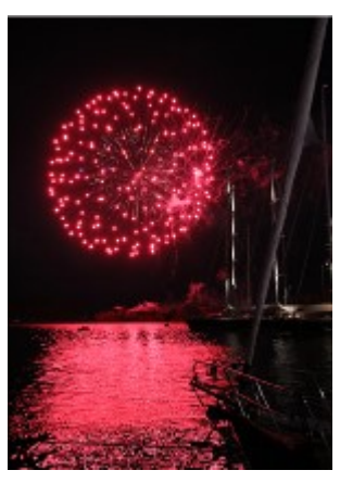
New Year's Eve in Antigua

A short 40nm reach south is Deshaies, Guadeloupe, where you will feel that you have been transported to a quaint French village. Love botanical gardens? Visit spectacular nearby <u>Jardin Botanique</u>.