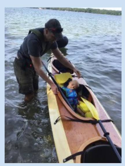
Boats are Boring